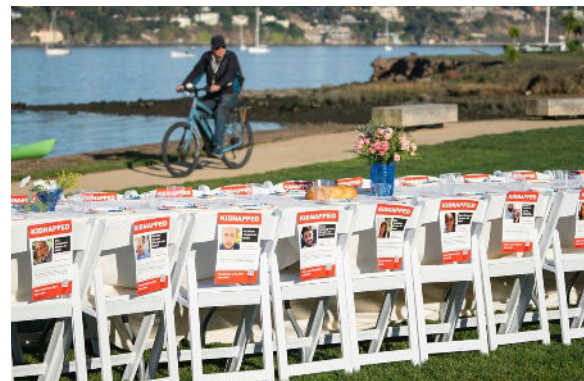
After the events of October 7th, Bay