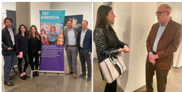
Young professionals and JFNA National Young Leadership Cabinet members